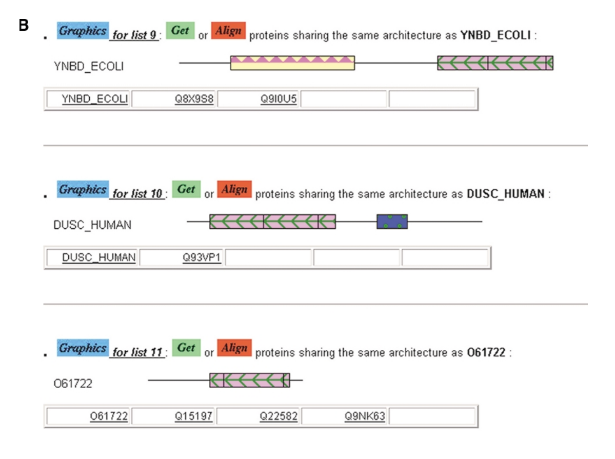
Figure 1. (Opposite and above). New graphical user interface for viewing protein matches of a particular InterPro entry. (A) Graphical view of representative list of proteins matching IPR000340, in which consensus domain boundaries have been computed for the domain line, and parent and children entries have been collapsed into one family line. This enables the family and domain composition information to be seen at a glance. (B) From the "more proteins in list" link in view a.) it is possible to show all proteins sharing a common domain architecture These protein sequences can then be retrieved or their alignments can be visualised.

InterPro has developed an improved user interface for visualisation of the protein matches in a condensed graphical view derived from the ProDom graphical interface (4). The consensus domain boundaries are computed, and the resulting protein matches are combined rather than each signature being displayed (Fig. 1A and B). Parent/child related InterPro entries are collapsed into one line, while domain entries are shown on separate line, thereby providing a simple view of family and domain composition. From this view, all proteins sharing a